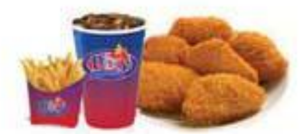
Kids Nuggets Meal